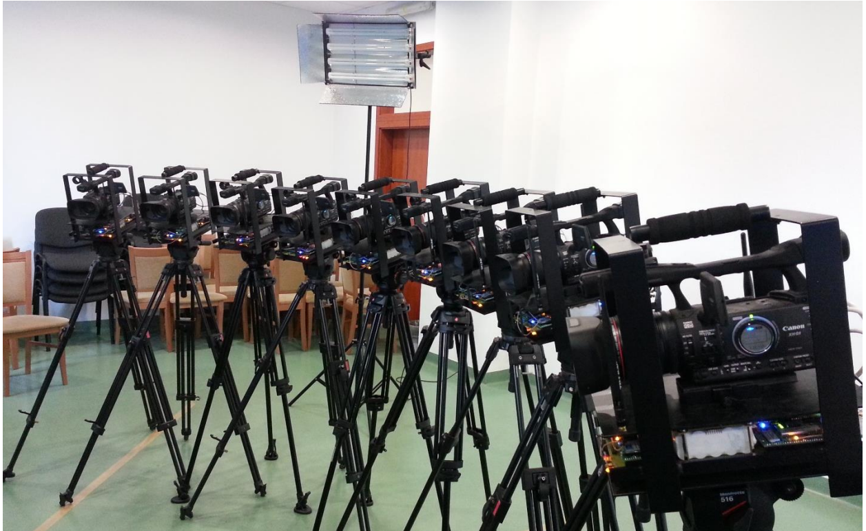
Figure 3. Multi-camera system used in production of the presented test sequence.