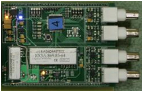
Figure 2. Wireless synchronization module.