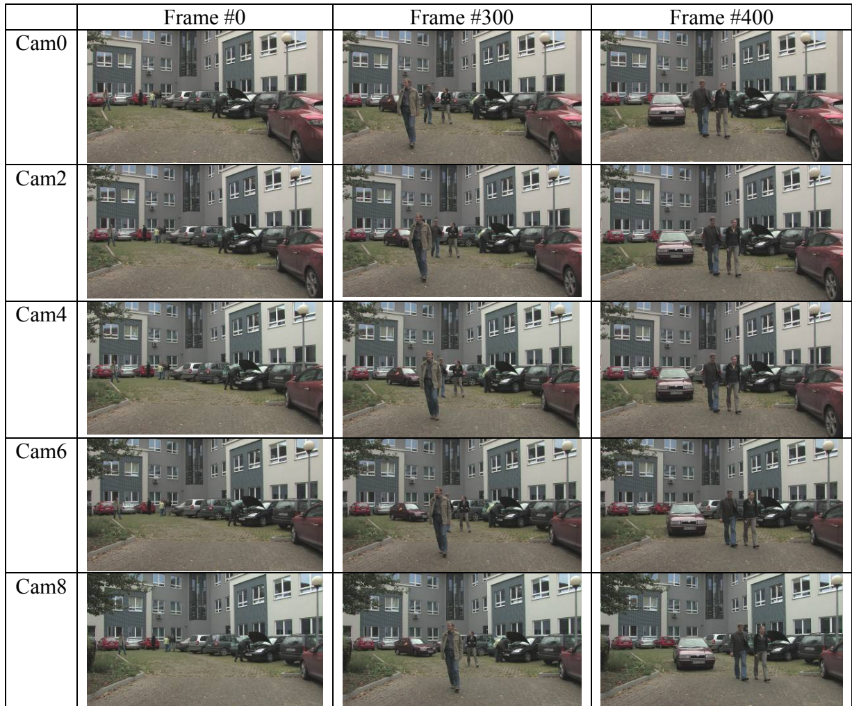
Figure 4. Some frames of 'poznan_carpark' sequence.