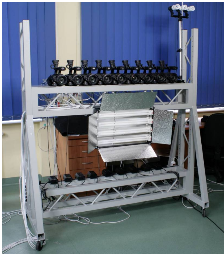
Figure 1. Multiview camera rig.

All cameras are arranged equidistantly along a straight line with parallel optical axes. The inter-axial distance between neighboring cameras is approximately 13.75 cm and the distance between optical centers of outer cameras is 110.0 cm .