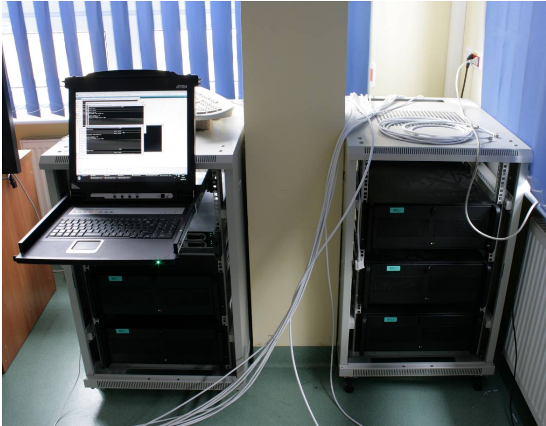
Figure 2. Recording system.